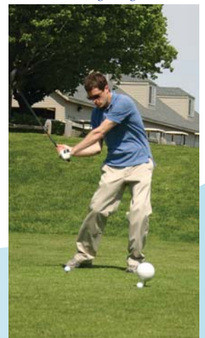
A golfer warming up on the driving range.