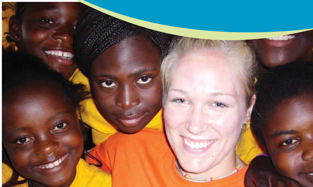
Hugs and smiles were easy to come by!