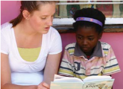
The orphan children so appreciated help with their reading. They did not want to stop!

Zambian counselors to run Get Connected! Camps for their girls in the future, and to inspire the oldest GEMS at camp to be counselors at future camps.