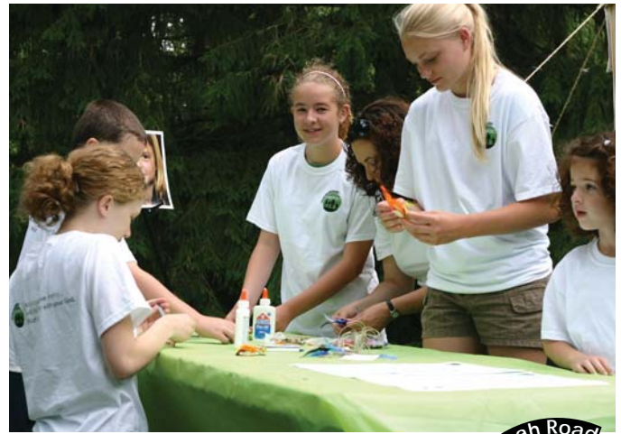
A group of girls enjoying themselves while walking and learning along the Micah Road!