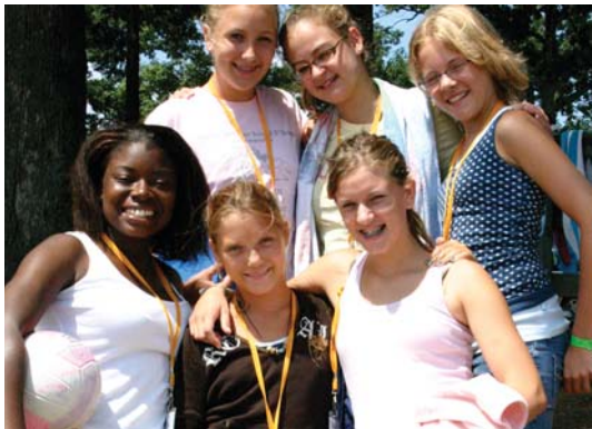
A group of GEMS at camp take a break from volleyball!

Exploring the depth of God's truth in order to connect with Him, early teen girls from across the US and Canada will have a chance to attend Get Connected! Camp in the summer of 2009. Please