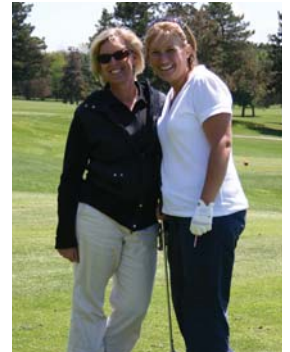
Two golfers enjoying the beautiful weather!