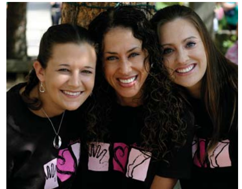
Three GEMS Counselors from California enjoying the 50th Anniversary celebration!