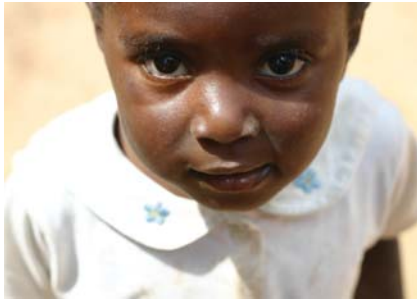
A young African girl we met while visiting GEMS Clubs in Zambia.

Unfortunately, the countries hit hardest by this pandemic are already struggling with poverty, hunger, and general economic strain—leaving the children, the AIDS orphans—little hope for the future. The immensity of this problem