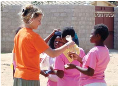
Camp games were fun!